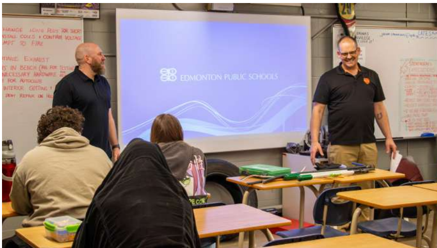
M.E. LaZerte Speaker Series - April 2025