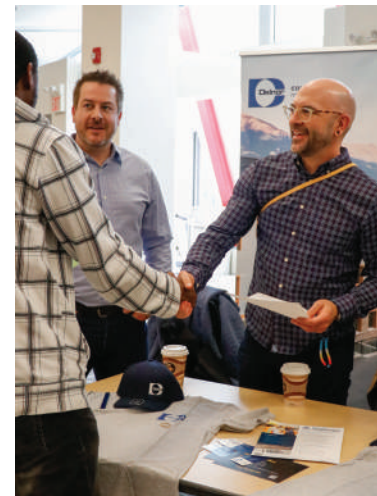
Parallel Job Placement Event - March 2025